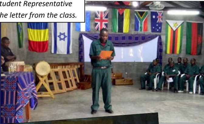
The Student Representative reads the letter from the class.