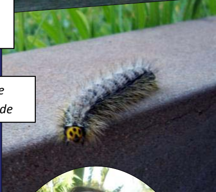
A funny face spotted outside