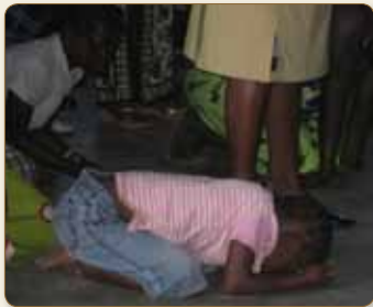
The beginning of revival during 25 days of prayer and fasting