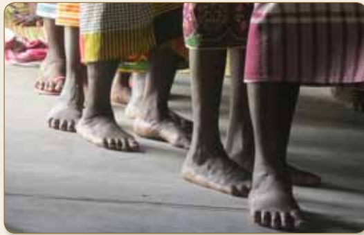
How beautiful are the feet of them who come to hear good news.